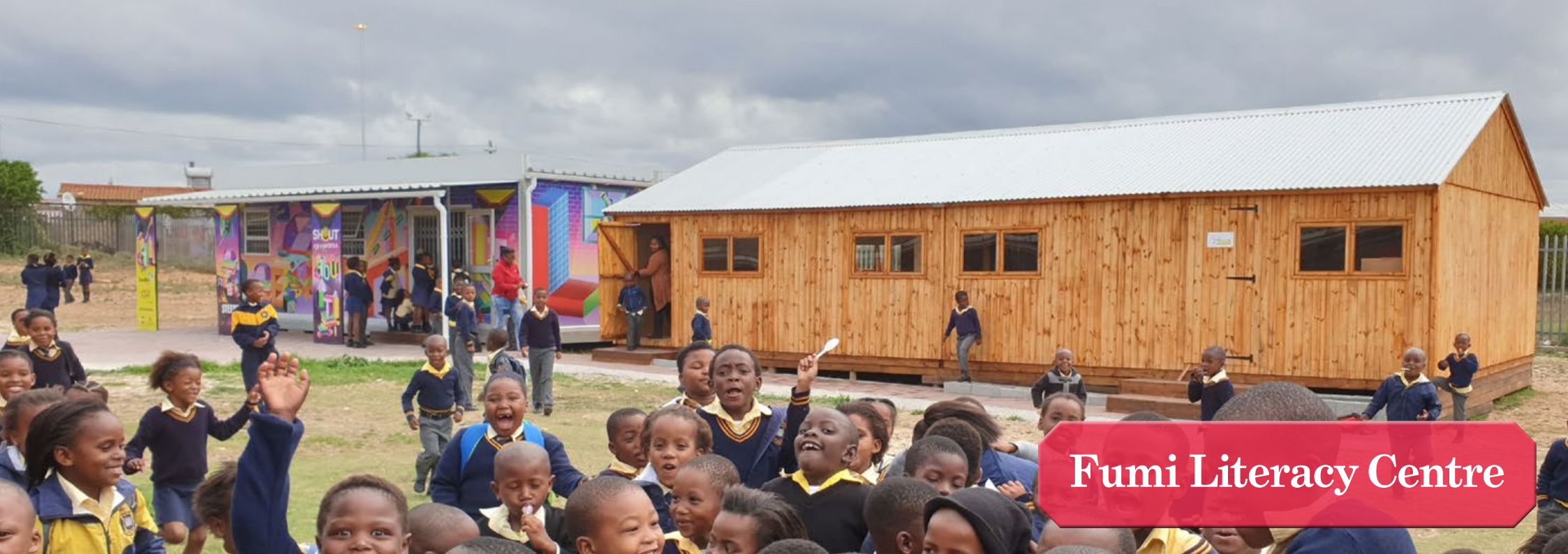
Fumi Literacy Centre